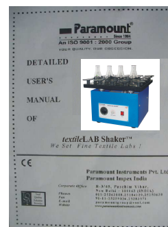
This User's Manual

textile LabSHAKER is Supplied Complete with below Accessories: