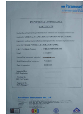
Calibration & Inspection Conformance Certificates

spectraVIDE I Nx ™ is Supplied Complete with below Accessories: