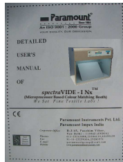
This User's Manual