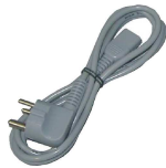
Main Lead with Plug