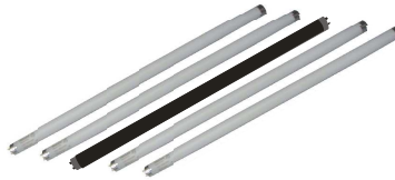
Tube Lights – 05 Nos.