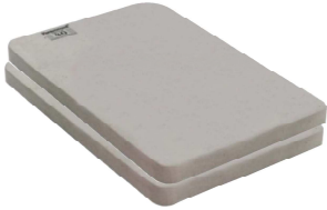
Cutting Pads 02 Nos. (Specially Rubberized for Long Life)