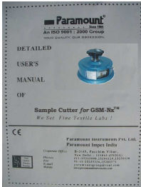
This User's Manual