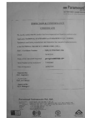
Calibration & Inspection Certificate

pH METER (Portable) is Supplied Complete with below Accessories: