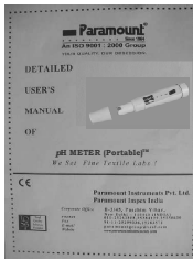
This User's Manual