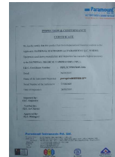
Calibration & Inspection Certificate

pH METER (Portable) is Supplied Complete with below Accessories: