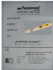
This User's Manual