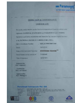
Calibration & Inspection Conformance Certificate

FABRIC STIFFNESS TESTER is Supplied Complete with below Accessories: