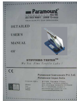
This User's Manual