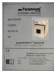
This User's Manual