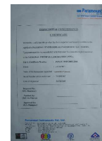
Calibration & Inspection Conformance Certificate

Unpack your dyeMASTER™ (Infrared) and ensure that you have the Following units :