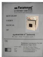
This User's Manual