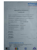
Calibration & Inspection Conformance Certificate

Unpack your dyeMASTER™ (Infrared) and ensure that you have the Following units :