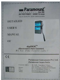
This User's Manual