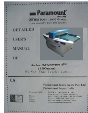
This User's Manual