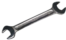
Double end Spanner (30 – 27 mm)