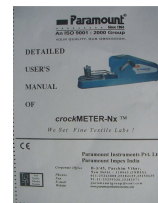
crockMETER I Nx ™ This User's Manual