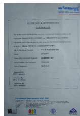
Calibration Inspection & Conformance Certificate