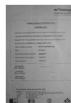
Inspections & Calibration Certificates

Unpack your checkMASTER III ™ and ensure that you have the Following units :