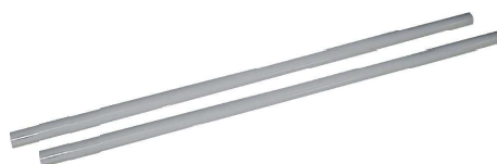
PVC Pipes – 02 Nos. (For Fabric Rolling)