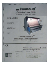
This User's Manual