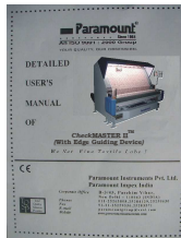
This User's Manual