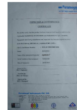
Inspections & Calibration Certificates

Unpack your checkMASTER III™ and ensure that you have the Following units :