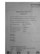
Inspection Conformance Certificate