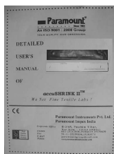
This User's Manual