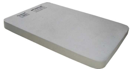
Special Grade – Cutting Pads 02 Nos.